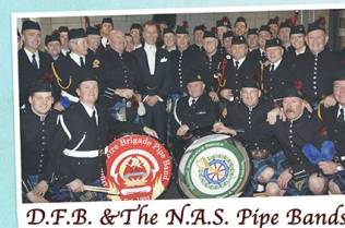
D.F.B. & The N.A.S. Pipe Bands