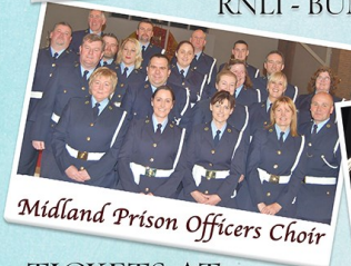
Midland Prison Officers Choir