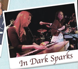
In Dark Sparks